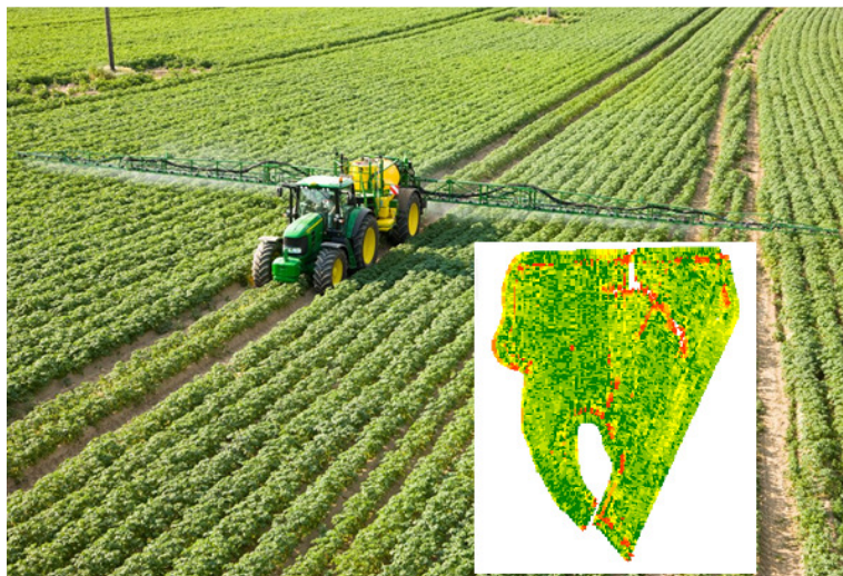
Figure 1: Precision Spraying in a potato field.

The Smart Spraying Pilot targeted to investigate and demonstrate the requirements for Future Internet technologies from the point of view of Precision Agriculture and beyond. Precision spraying was chosen as an example case since it is an information intensive task, and is sensitive with regard to weather circumstances, timing, correct chemical dosing, food safety and environmental impacts. Well controlled precision spraying task with optimal timing and spraying setups is a complex and demanding task for a farmer. Extra challenge is to cope with the suddenly changed situations like change in weather or machine breakdown during the spraying. When contracting spraying, the challenge is also to serve optimally customer farm's business targets and act correctly in sometimes unfamiliar fields.