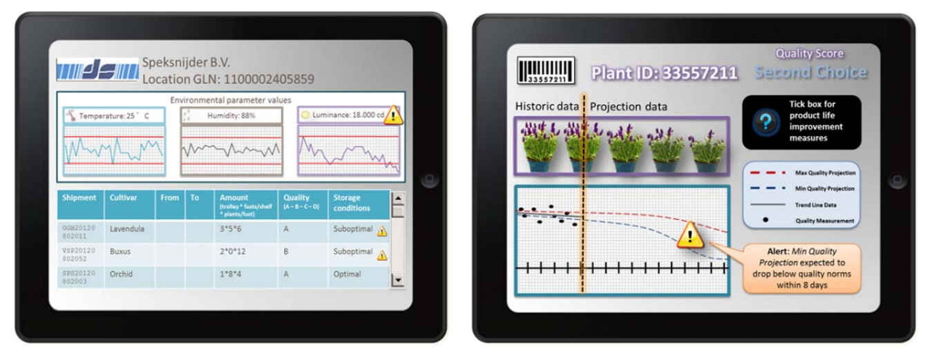
Figure 1: Mock-ups Quality Monitoring and Quality Projection Screens

The scope of the pilot is a supply chain from production to retail. The focal company is a Dutch trader with the role of supply chain orchestrator. Via this trader, also a grower, transporter and auction are incorporated. The pilot is leveraging the trader's logistic tracking system, which is based on the ultrahigh-frequency RFID tags that are attached to the complete pool of plant trolleys.